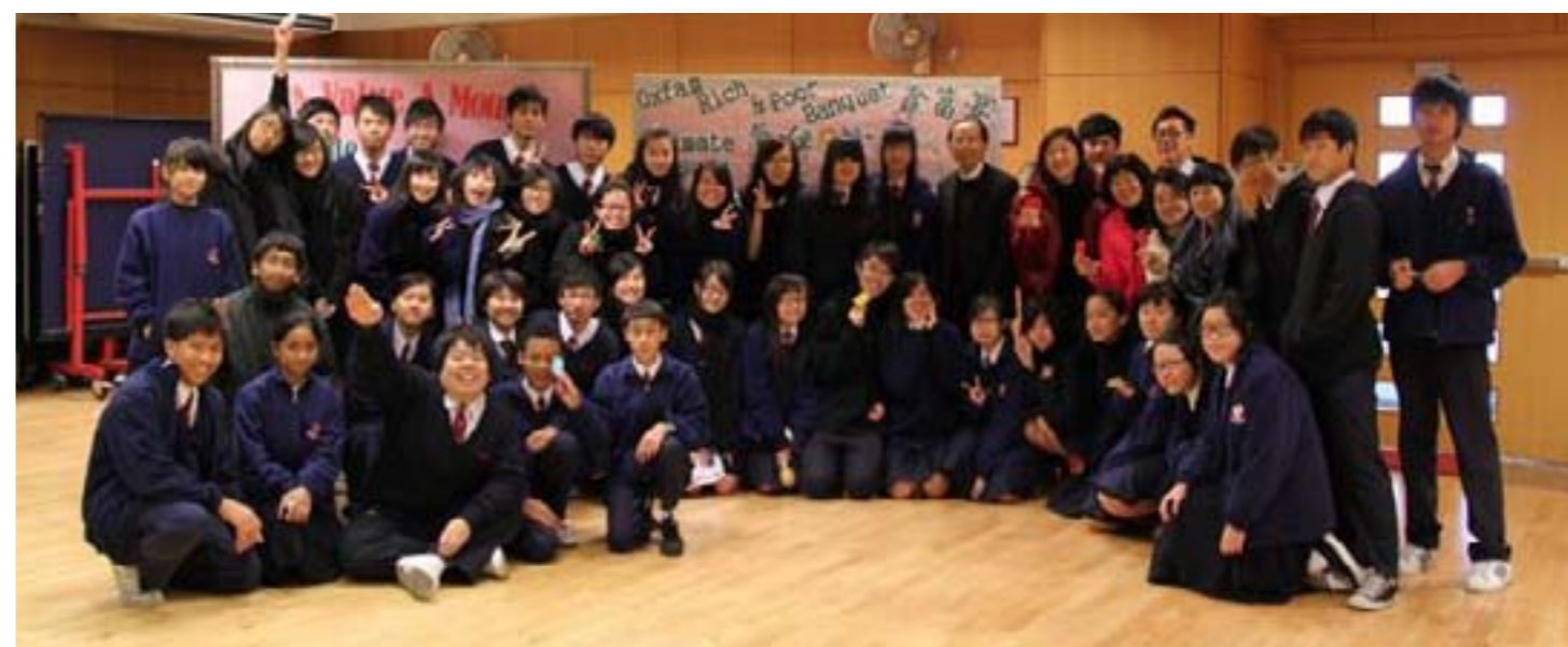
Oxfarm Rich and Poor Banquet